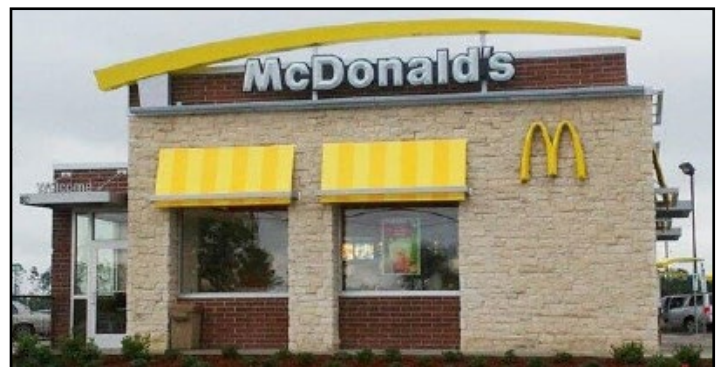
After - 5th Avenue & Roosevelt Road, Maywood, IL