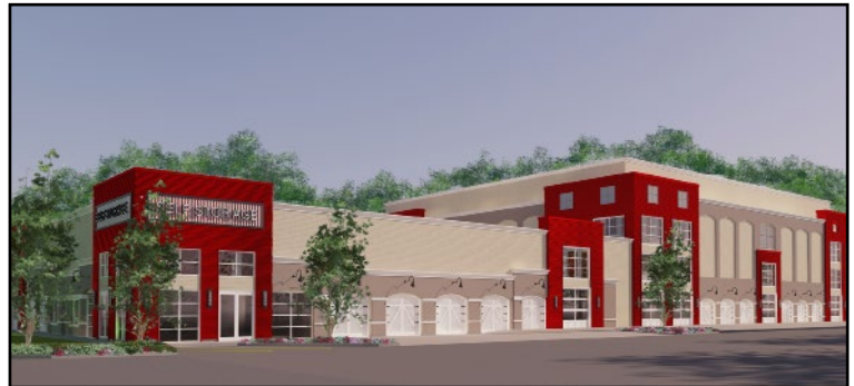
After - Rendering of Building Re-Use, Storage Unit