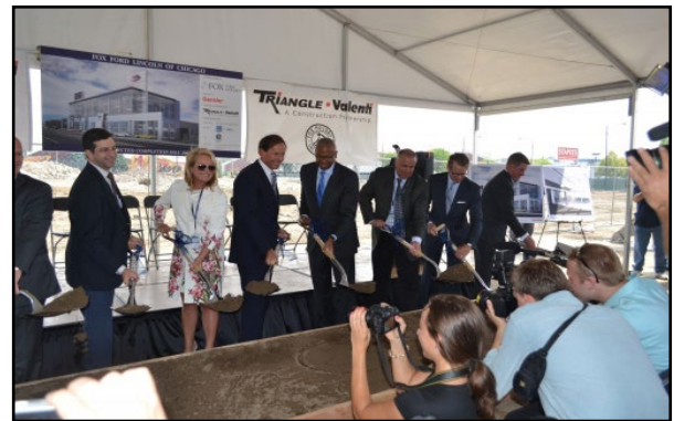
Fox Motors Ground Breaking Ceremony, 2014