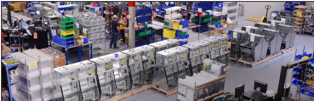
Fabtech IGM Solutions, Metal Fabrication in 2013. Libertyville, IL.

Designed to provide manufacturers with access to adequate and affordable financing for upgrading and modernizing their manufacturing equipment and operations.