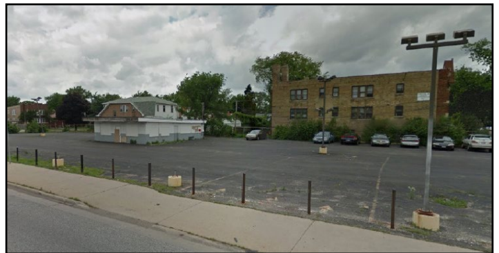
Before - 5th Avenue & Roosevelt Road, Maywood, IL

There have been many successful re-development projects that have returned properties to the tax rolls in 70 municipalities and 3 townships that have participated. Currently, Cook County’s Neighborhood Stabilization Program (NSP) is working with the City of Chicago Heights and other communities to build affordable housing on land that was acquired through the No Cash Bid Program.