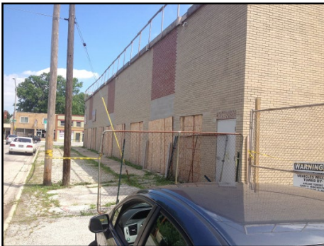
Before - Vacant Industrial Building